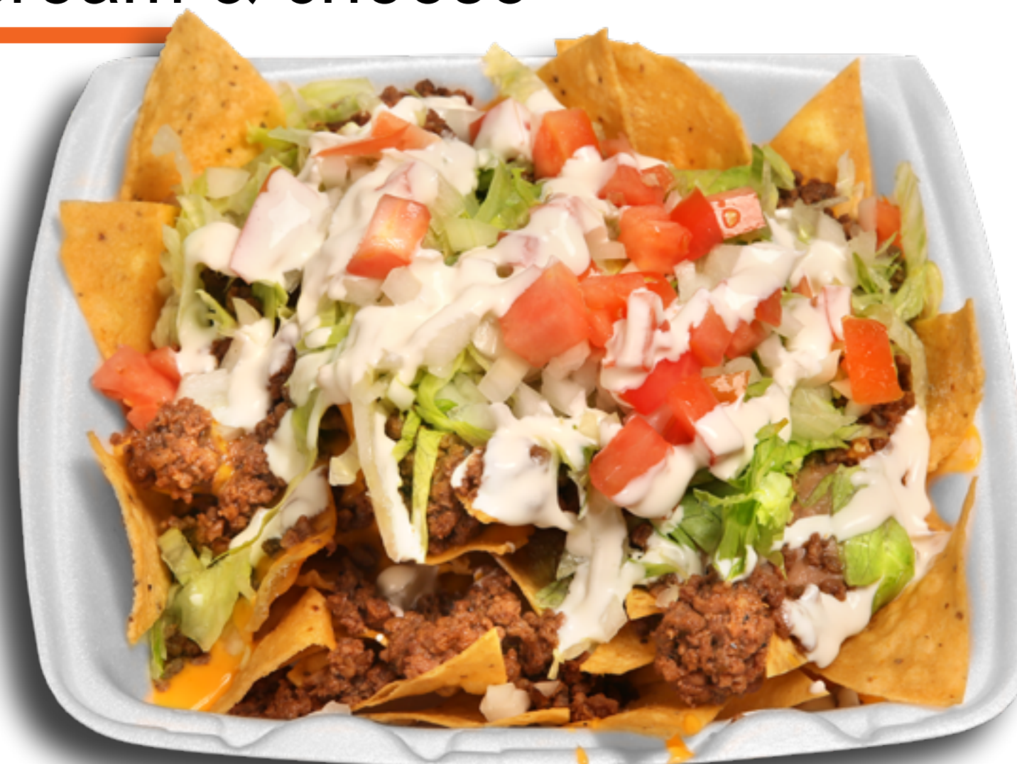
Nachos With Ground Beef