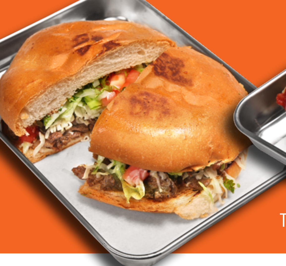
Torta de Asada