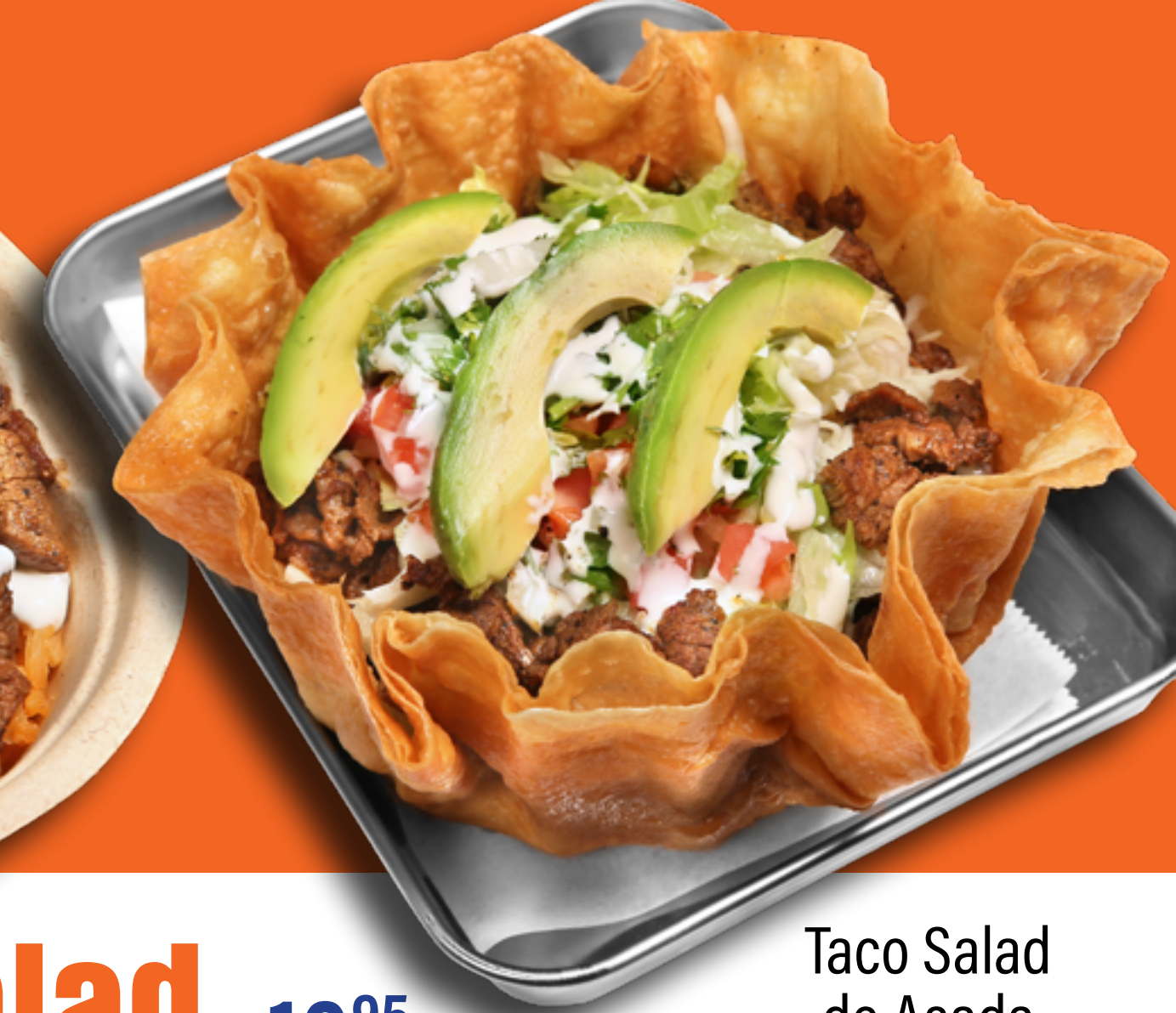
Taco Salad de Asada